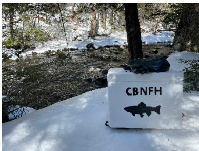
An egg cooler in the field.

Modern times have brought us Styrofoam coolers in lieu of wooden crates and sawdust. Each cooler has up to 4 trays and can carry approximately 40,000 eggs.