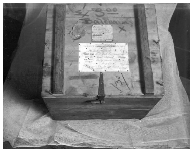
Below: Trays of eggs were boxed in wooden crates.