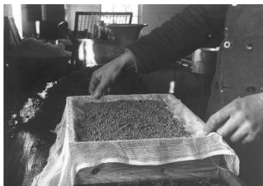
Above: Salmon eggs in a wooden tray being wrapped in wet cheesecloth.

Back in the 1880's hatchery folk packed salmon eggs in cheesecloth and moist sawdust for transport across the United States: